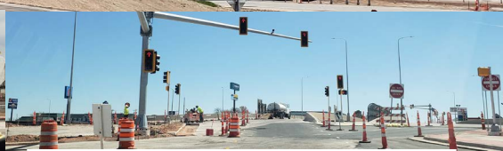
Operational traffic signals guide traffic through the interchange.

Follow the project progress on the project website: https://www.i90lacrosseddi.com/construction.html