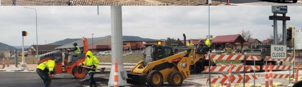
Asphalt placement to tie-in ramps and driving lanes on LaCrosse Street.