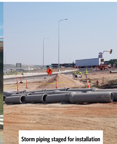
Storm piping staged for installation

Follow the project progress on social media https://www.i90lacrosseddi.com/construction.html