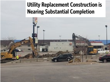
Utility Replacement Construction is Nearing Substantial Completion