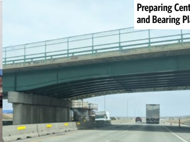
Preparing Center Pier Cap for Girder and Bearing Placement