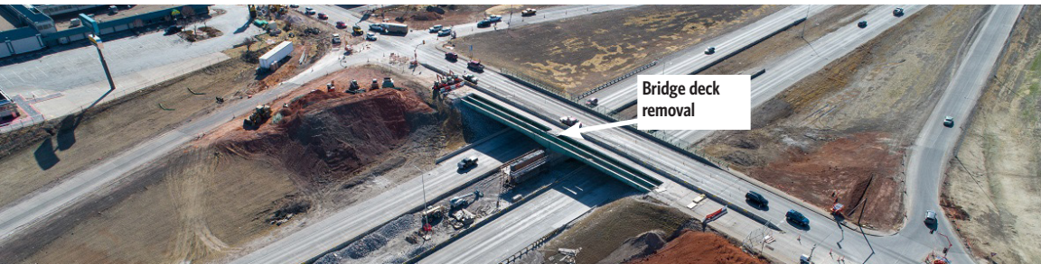
Equipment for Utility Replacement