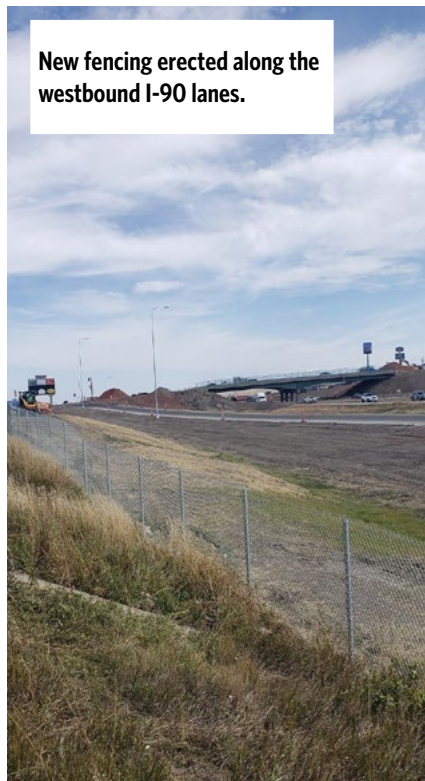
New fencing erected along the westbound I-90 lanes.

Concrete and asphalt surfacing is planned to wrap up for the winter.