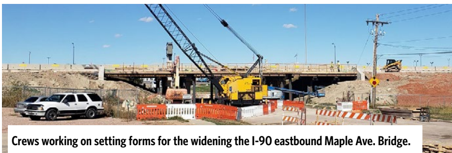
Crews working on setting forms for the widening the I-90 eastbound Maple Ave. Bridge.