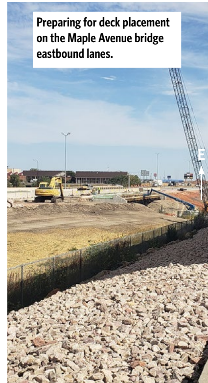
Preparing for deck placement on the Maple Avenue bridge eastbound lanes.