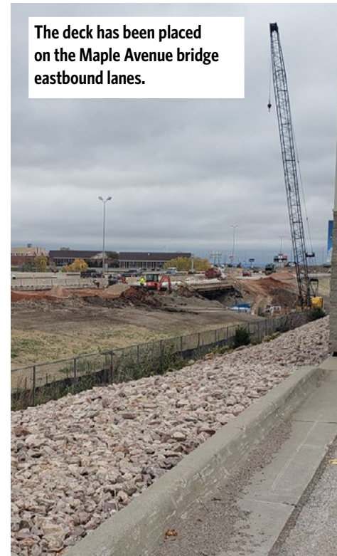
The deck has been placed on the Maple Avenue bridge eastbound lanes.