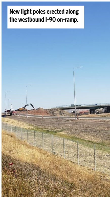
New light poles erected along the westbound I-90 on-ramp.

Concrete and asphalt surfacing is planned to wrap up for the winter.