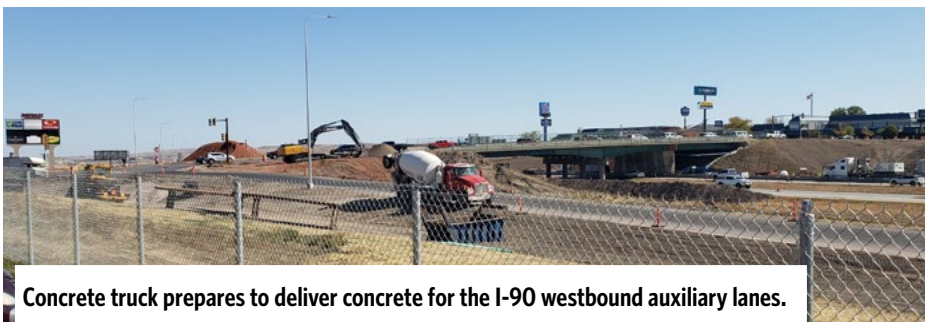
Concrete truck prepares to deliver concrete for the I-90 westbound auxiliary lanes.